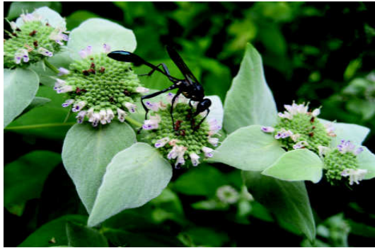
Thread-waisted wasp on Mountain Mint, Pycnanthemum virginianum.

Worthley Garden at Howard Co Conservancy: $250