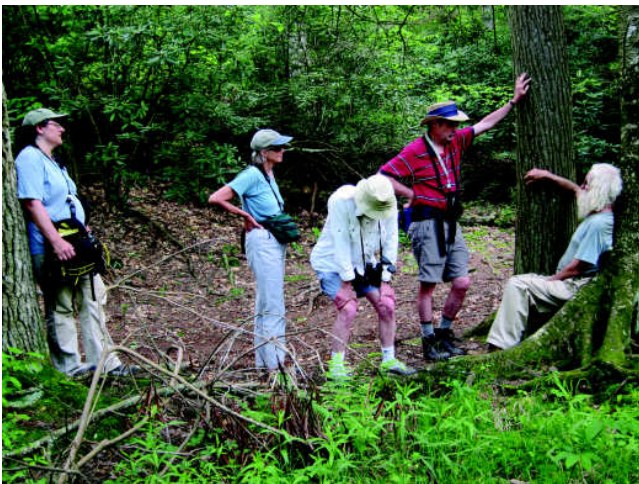
Resting and chatting at Tannersville Bog Preserve.