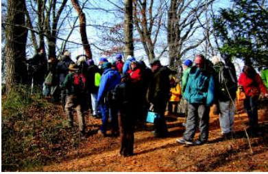
Fort Totten, D.C.