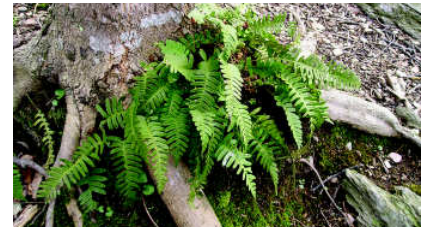
Common Polypody.