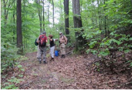
Fort Stanton, DC