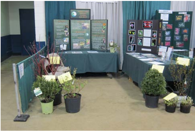
Our booth at the Spring Home & Garden Show at the Maryland State Fair Grounds in Timonium