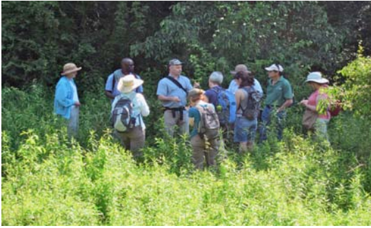
Carex ID Workshop organized by the Baltimore Chapter. Day 2 was a field trip to Gunpowder State Park.