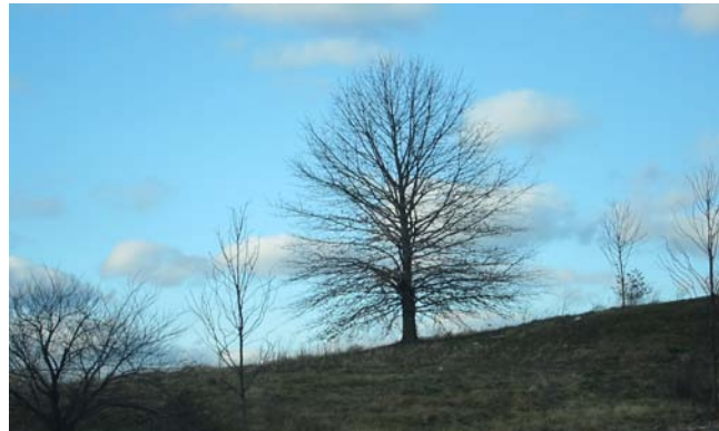
Quercus palustris , Baltimore City

Our mission is to promote awareness, appreciation, and conservation of Maryland's native plants and their habitats. We pursue our mission through education, research, advocacy, and service activities.