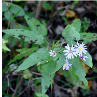
Short's Aster, Symphyotricum shortii , at Snavely's Ford, Antietam Battlefield