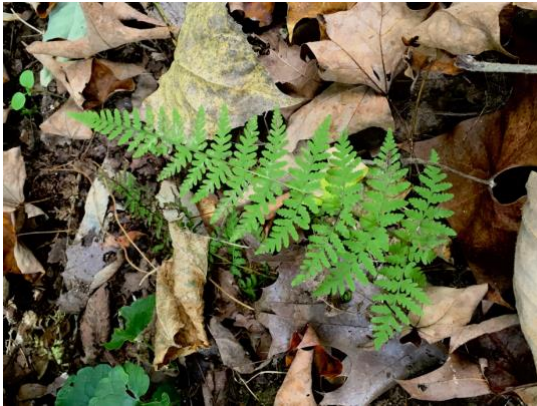
Bulblet Fern, Cystopteris bulbifera (S3), at Snyder's Landing