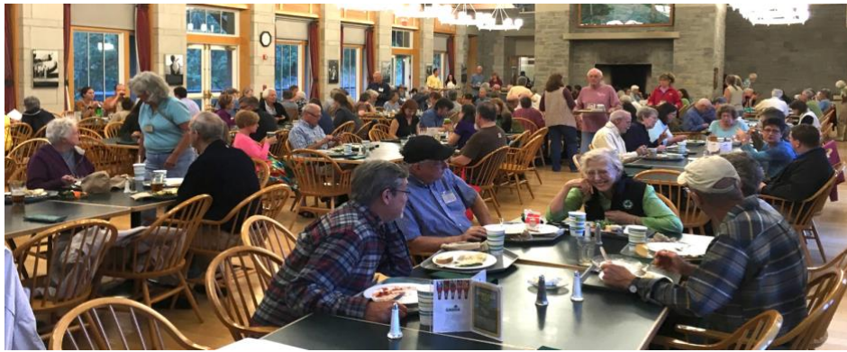
Dining Room at the Conference Center

For the complete schedule of activities, please see pages 12-13.