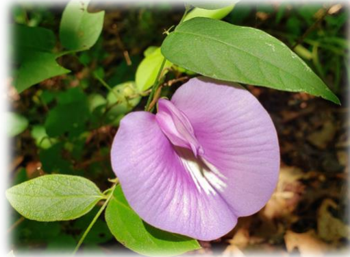
Spurred Butterfly Pea, Centrosema virginiana