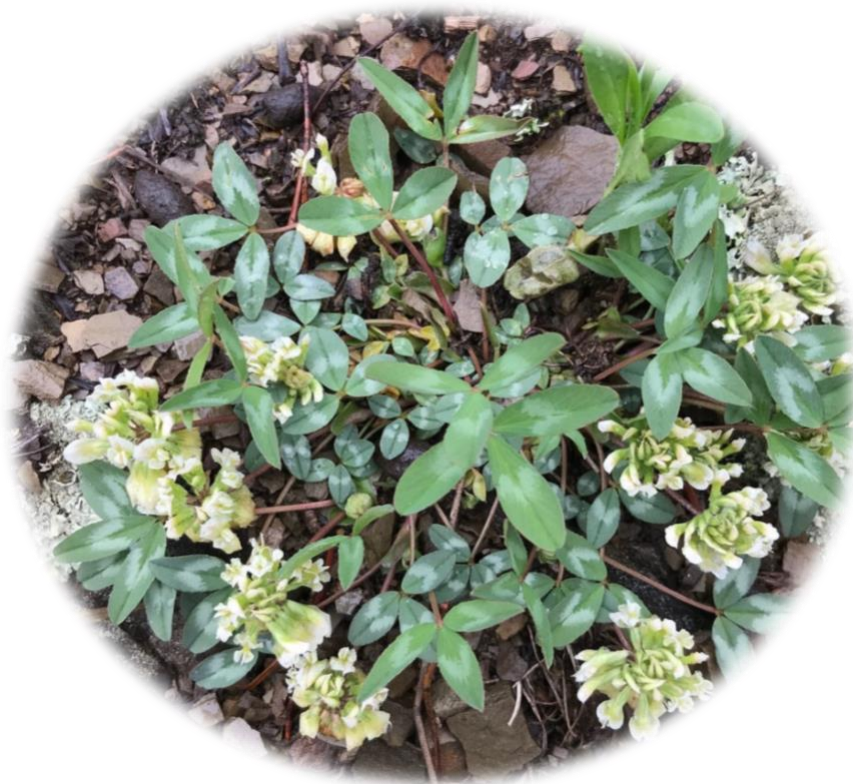
Kate’s Mountain Clover, Trifolium virginicum (Rare and Threatened)

This report provides an overview of the Maryland Native Plant Society in 2017, an all-volunteer organization with about 1200 members throughout Maryland. No other organization offers so many field trips and programs, free of charge, for people interested in exploring and learning about the natural areas of Maryland and our region. We believe we make a difference to public awareness of the importance of preserving Maryland’s native habitats