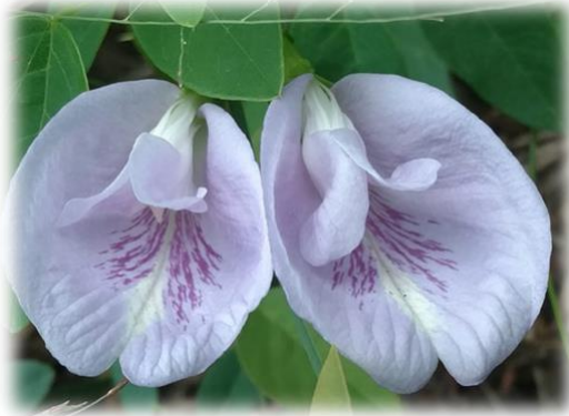
Atlantic Pigeonwings, Clitoria mariana