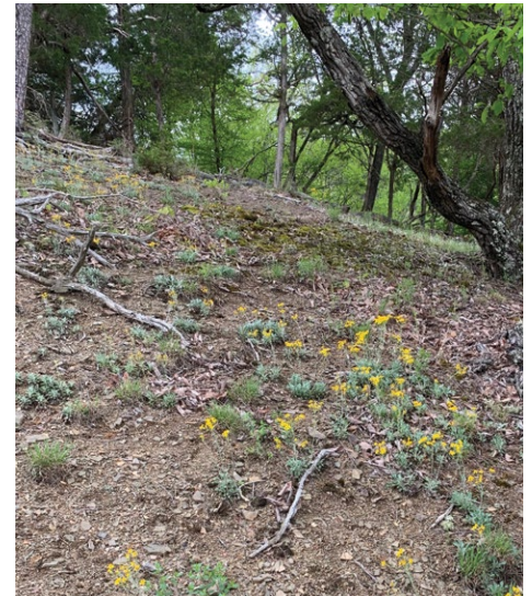
Fig. 2. Half of the historic stations for Ozark Milkvetch ( Astragalus distortus ) in the mid-Atlantic area we visited this year—including the River Road barren in Montgomery County, Maryland (left), which has become invaded by Amur Honeysuckle — no longer harbor this species. Uninvaded, high quality shale barren ecological communities—such as this one in the Green Ridge State Forest in Allegany County, Maryland (right)—receive bright sunlight at ground level and support healthy Ozark Milkvetch populations.

1. Ozark Milkvetch is probably an obligate heliophyte, as has been demonstrated experimentally for other plant species similarly restricted to shale barren ecological communities (Baskin & Baskin 1988). Such plants require bright sunlight to complete their lifecycle and cannot compete successfully in heavily shaded conditions. We base our hypothesis on the observation that Ozark Milkvetch was absent from half of the historically