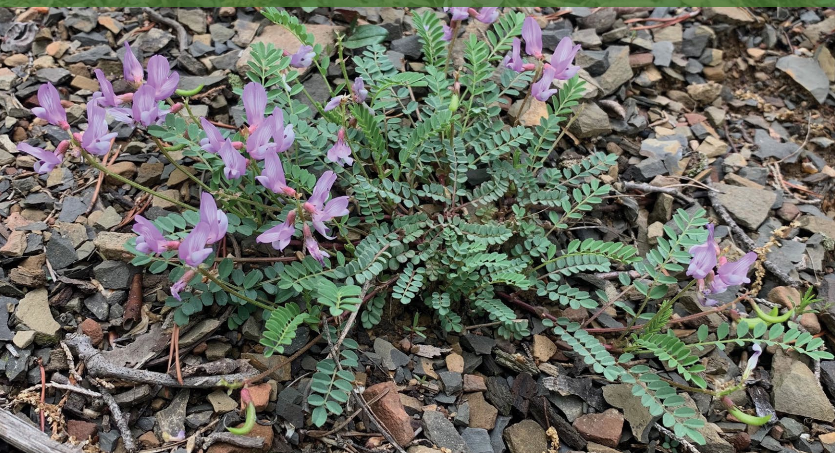
Ozark Milkvetch ( Astragalus distortus ) is an herbaceous perennial that grows exclusively on shale barrens in the mid-Atlantic. Shale barrens are characterized in part by rocky soils that lack a well-developed organic layer.