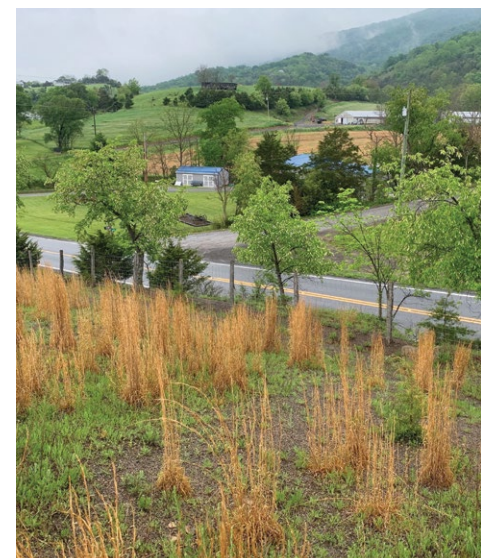
Fig. 3. Anthropogenic habitats can harbor Ozark Milkvetch. An old power line right-of-way that is kept clear of underbrush (left), harbors Ozark Milkvetch, which can be seen along the bottom-center edge of the image. An ungrazed pasture that includes invasive star-thistle ( Centaurea stoebe ) and is mown by the landowner to prevent soil erosion and encroachment by woody plants (right), also provides habitat for Ozark Milkvetch.